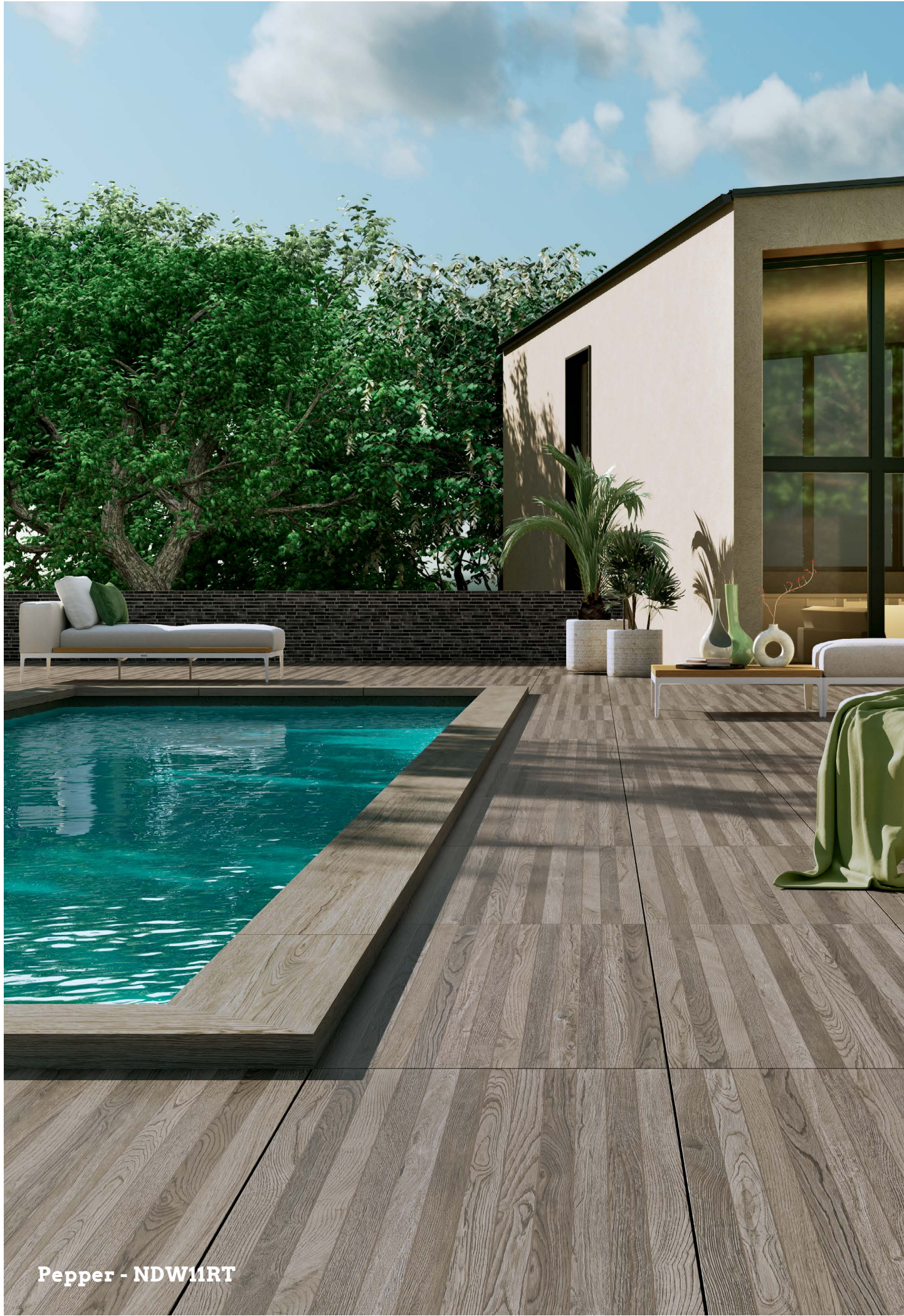
Pepper - NDW11RT