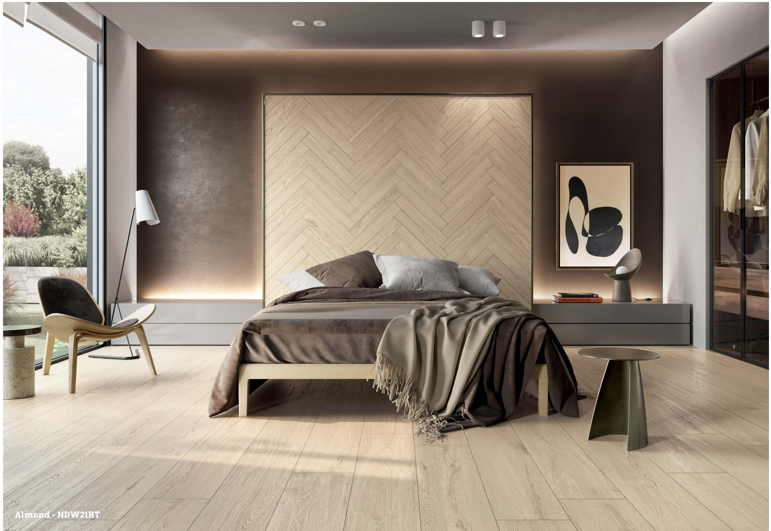
Almond - NDW21RT