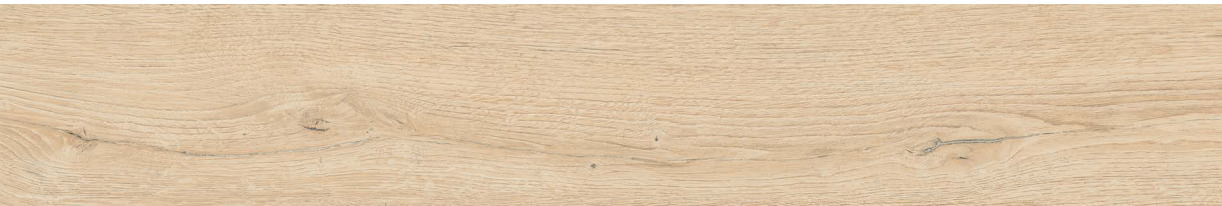
NDW21RT 200 x 1200mm 7" 7/8 x 47" 1/4