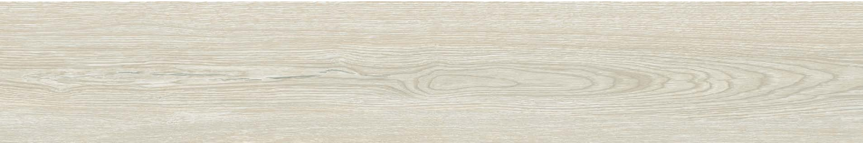
NDW81RT 200 x 1200mm 7" 7/8 x 47" 1/4