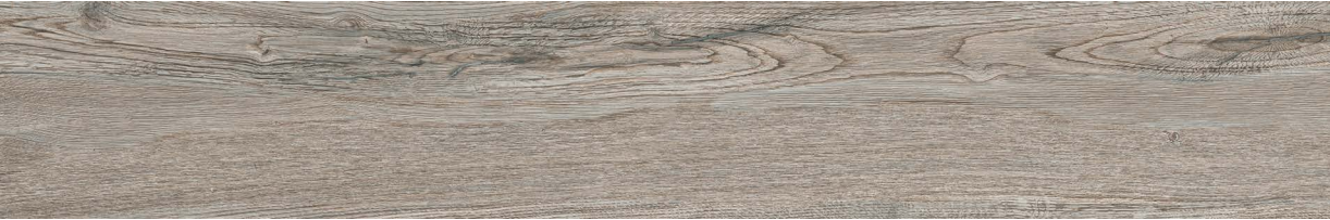
NDW11RT 200 x 1200mm 7" 7/8 x 47" 1/4